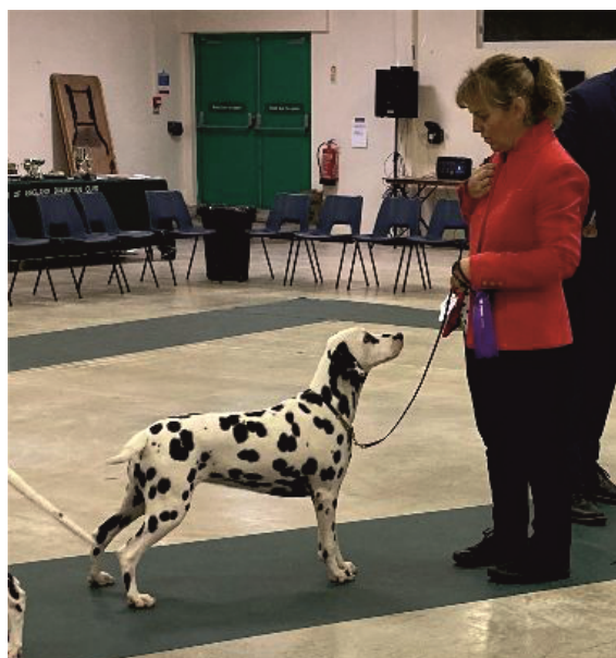
Mapplewell Limited Edition