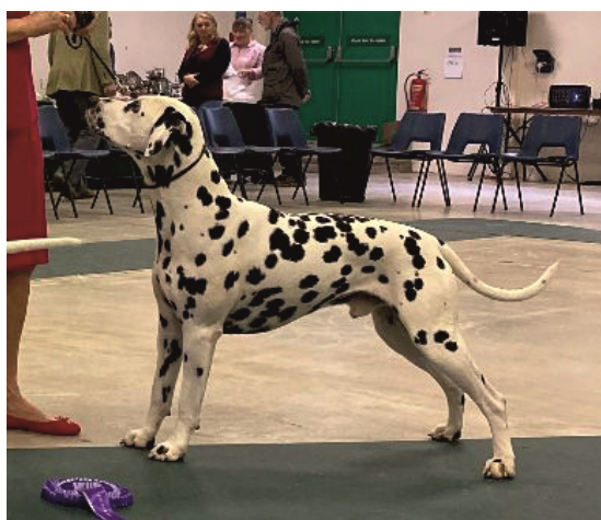
Ch Tamilanda Midnight Lilly JW