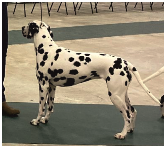
Malbreow Wish Upon A Star