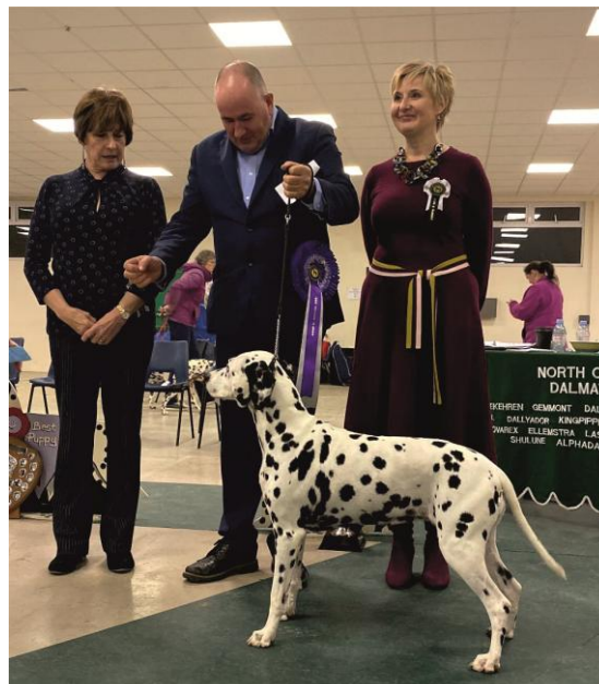
Ch Phadante Dixie Lily JW